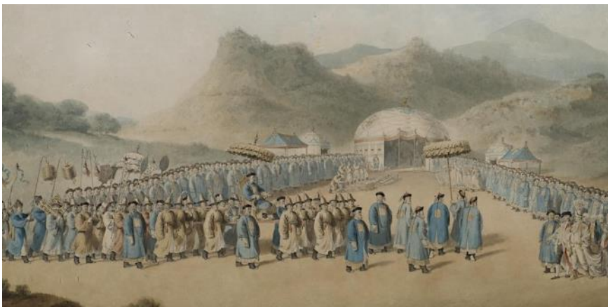
RAS 05.001 'The Approach of the Emperor of China to his Tent in Tartary to receive the British Ambassador'